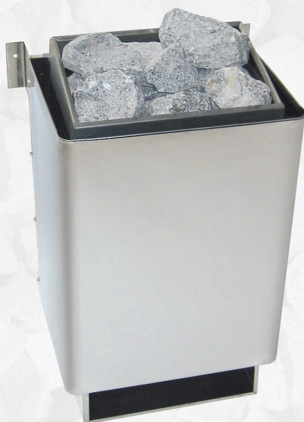
Type W 30